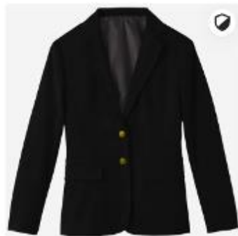
Feminine Fit Crease-Proof Blazer