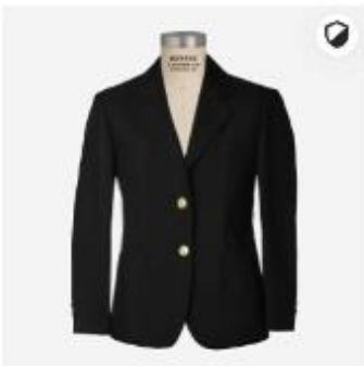
Girls' Gabardine Blazer