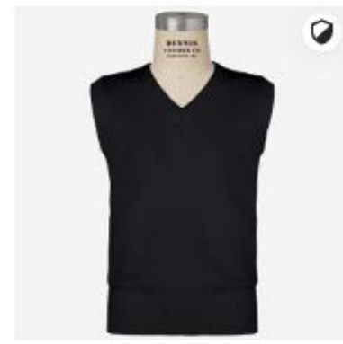
V-Neck Pullover Sweater Vest