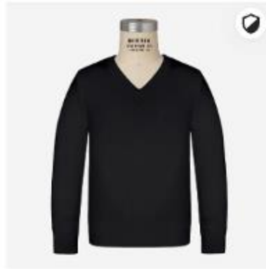
V-Neck Pullover Sweater