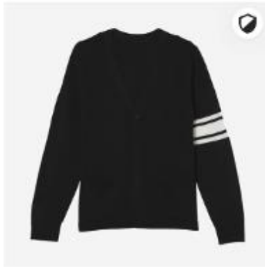
V-Neck Button-Front Cardigan with