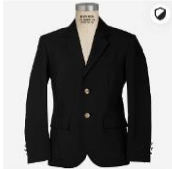
Boys' Gabardine Blazer