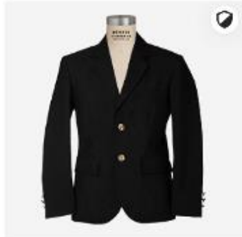
Men's Long Gabardine Blazer