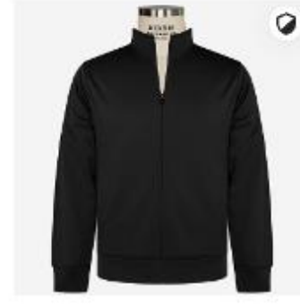
Moisture-Wicking Zip Front Fleece Jacket