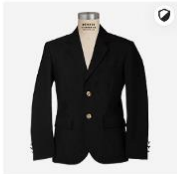
Men's Long Gabardine Blazer